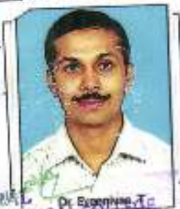
Photo ID submitted : Passport copy / PAN Card / Voter ID / Aadhaar Card. Number 8318 3002 6179 issued by ULAI.